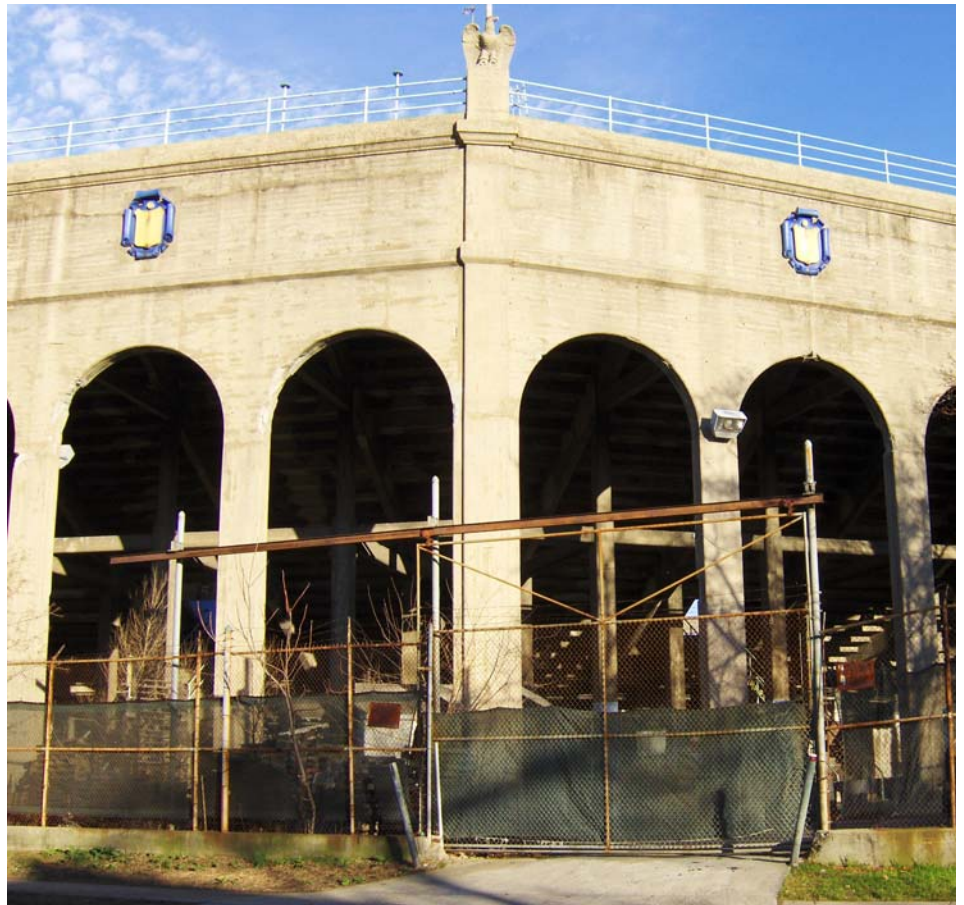
Forest Hills Stadium, Queens: a preservation battle in danger of being forgotten?

In a fundamental way the Archive Project is in the anniversary business. Think of us as the Hallmark store for preservationists. Though we don’t have any great cake recipes, we can suggest lots of ways you can use your anniversary to celebrate your past and inspire your future. All we ask is that you save us a piece of cake. ■