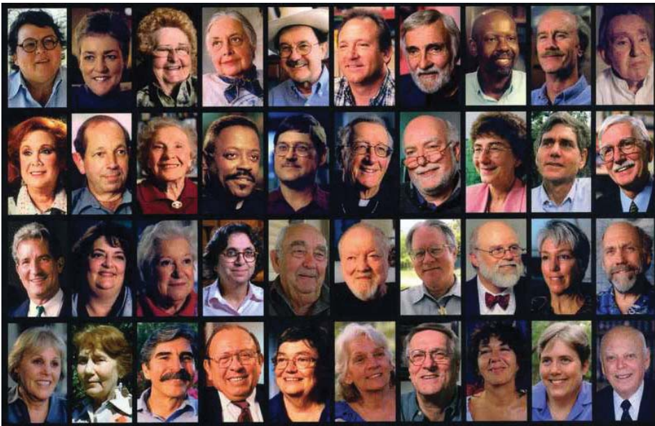
Detail from cover of the Texas Legacy Project: Stories of Courage and Conservation