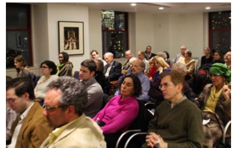
Audience at The Battle for Historic Districts panel; Courtesy of Ben Baccash