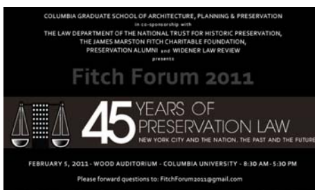
Save-the-Date card from the 2011 Fitch Forum; Courtesy of Columbia University