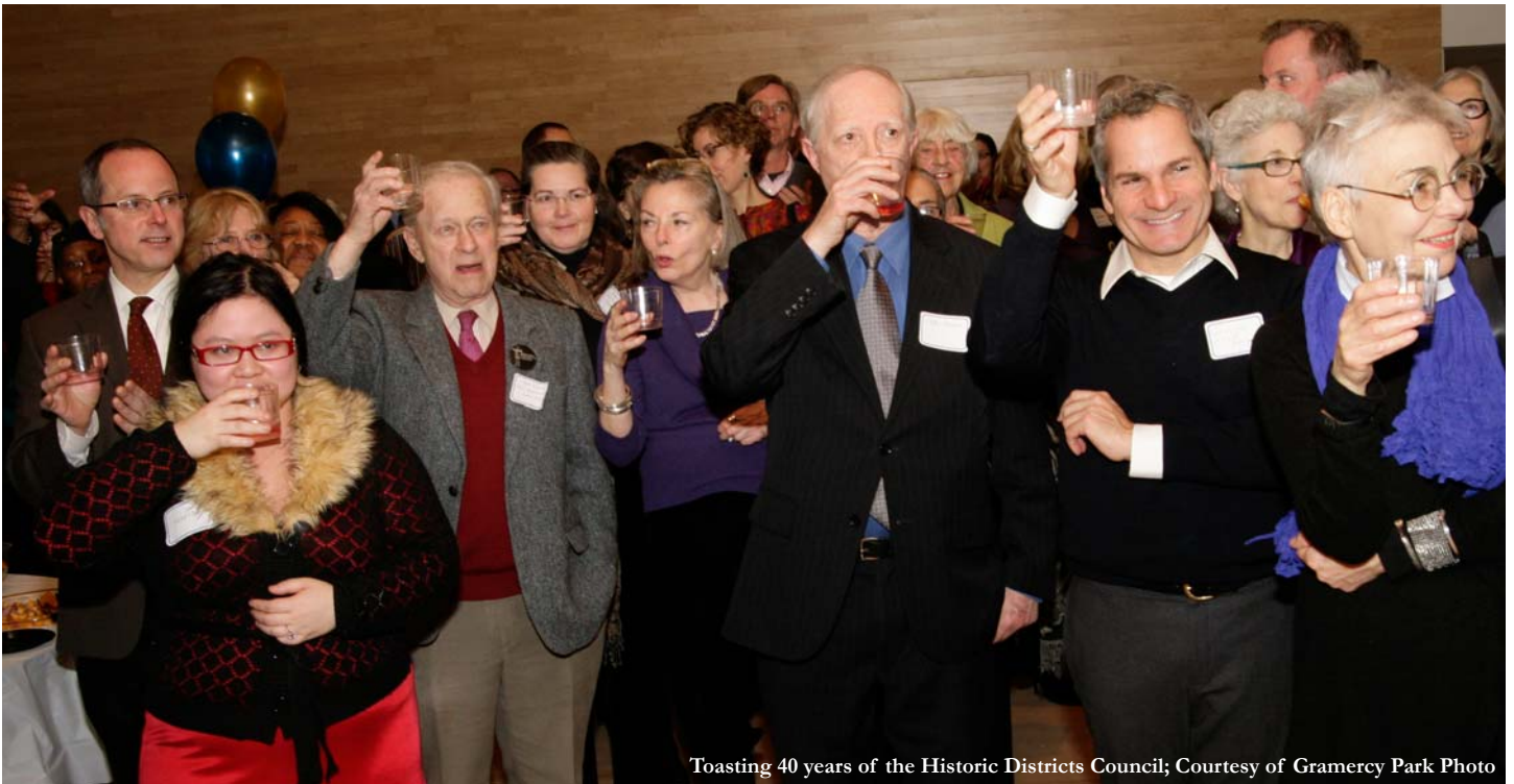
Toasting 40 years of the Historic Districts Council