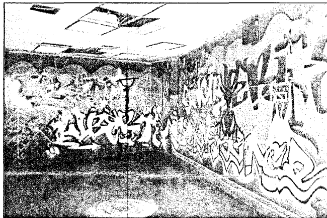
Graffiti marks an inside room in the building.

In the meantime, however, other aspects of the building's status had changed. In 1996, the Viacom Foundation, which had absorbed Gulf and Western, sold the right to enforce the conditions of