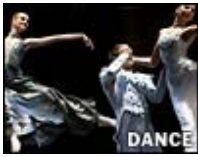
Review: Eifman Ballet