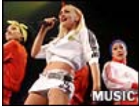
Ingredients of Pop Success