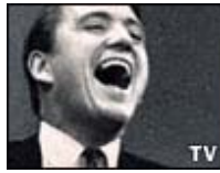
Merv Griffin: Chatting Superstar