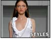
The Fall of Helmut Lang