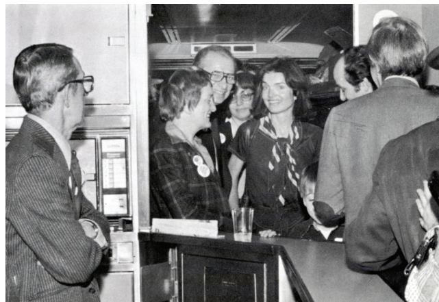
Jacqueline Kennedy Onassis and other Grand Central Terminal advocates aboard the Landmark Express, a chartered train that took the preservation activists to Washington, D.C. to protest Grand Central’s threatened demolition.

important precedents in its ruling. First, it affirmed that historic preservation serves a valid public purpose. Second, it established the balancing test that federal and state courts continue to use today to determine whether governments owe compensation to property owners for the diminution of their property rights as a result of land use regulation. What is not revealed in the text of the decision itself is the remarkable story behind the legal challenge. Why did lawyers frame their arguments using certain language? What strategic choices did they