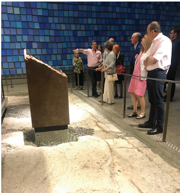
Stewardship Society members observe the preserved remnants of the box column footprints from the Twin Towers.

Programs & Events Celebrate Preservation Stories